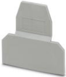
End cover, Length: 56 mm, Width: 2.2 mm, Height: 52 mm, Color: gray

Please be informed that the data shown in this PDF Document is generated from our Online Catalog. Please find the complete data in the user's documentation. Our General Terms of Use for Downloads are valid ( http://download.phoenixcontact.com )